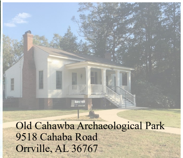
Old Cahawba Archaeological Park 9518 Cahaba Road Orrville, AL 36767