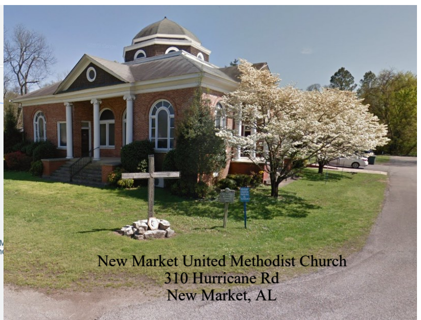
New Market United Methodist Church 310 Hurricane Rd New Market, AL